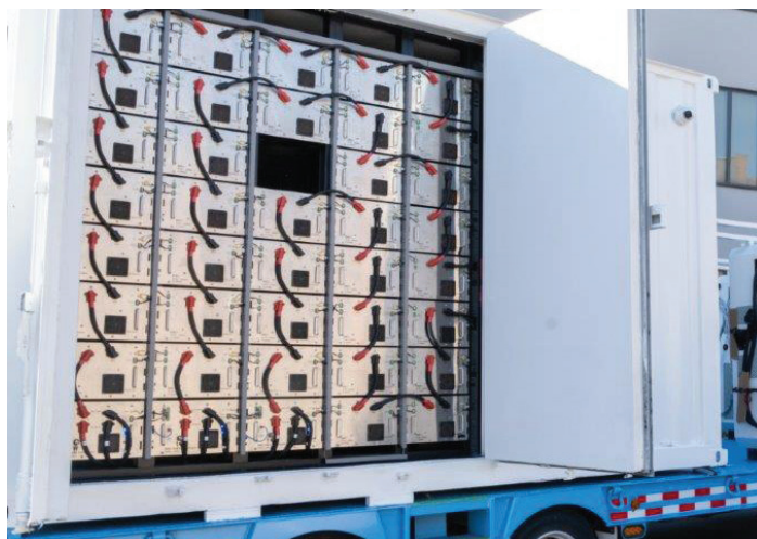
PICTURED: PROMIS non-walkable battery room