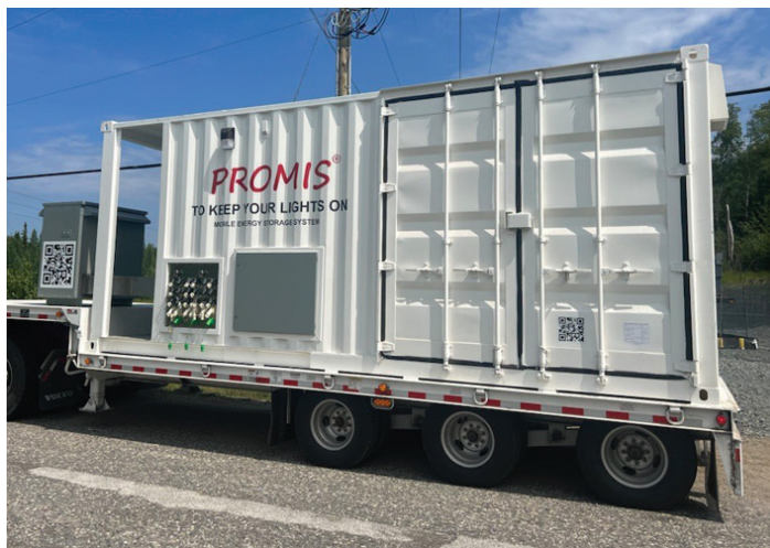
PICTURED: PROMIS trailer

PROMIS' platform is equipped with integrated microgrid technology and an on-board controller that provides comprehensive sets of autonomous controls, optimization schemes, and supervisory capability for ease of remote operator access and integration back to the Dispatch Center for overall grid coordination.