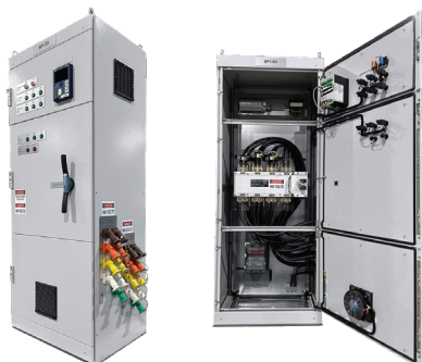
PICTURED: Tap Box